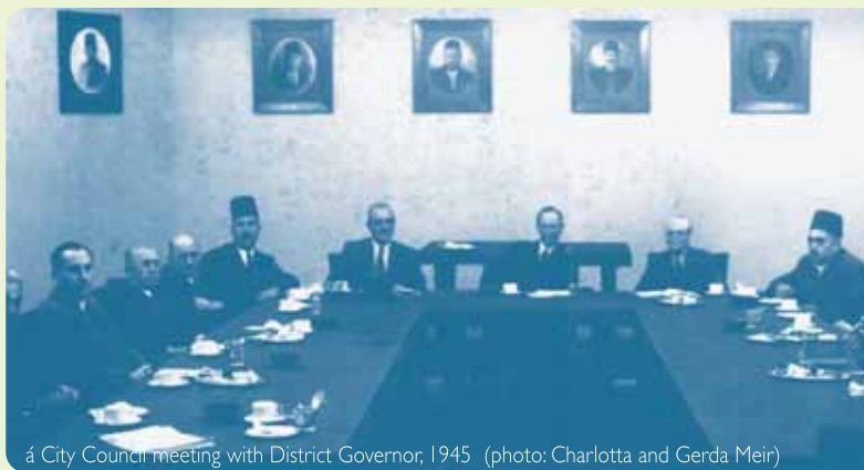
á City Council meeting with District Governor, 1945